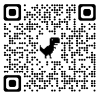
Setting the table

There are various healthy snacks on offer throughout the day at nursery which follow the NHS Setting the Table Guidance and Food Matters Nurturing happy, healthy children. Please scan the QR code below for further information: